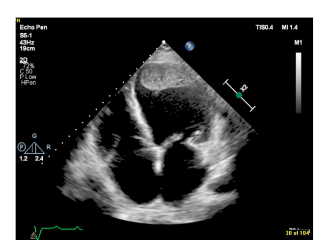
Fig. 1. LV Thrombus demonstrated by Transthoracic Echocardiography.

There is limited data available on the exact frequency of LV thrombus in primary PCI treated acute MI patients in Saudi Arabia. In the current retrospective study, we reviewed the incidence of LV thrombus and its associated risk factors in patients presented with acute myocardial infarction who were referred to King Abdullah Medical City (KAMC) Makkah. Because it is located at the holy capital Makkah, we had an opportunity to study the diverse but vulnerable, subpopulation of pilgrims in order to establish the incidence of LV thrombus in addition to the general population. The main objective of current study was to identify predictors so as to establish a strategy for vigilant surveillance of vulnerable groups with repeated screening for LV thrombus and its timely treatment.