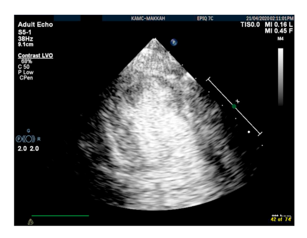
Fig. 2. LV Thrombus demonstrated by Echocardiography with IV contrast agents.

There is limited data available on the exact frequency of LV thrombus in primary PCI treated acute MI patients in Saudi Arabia. In the current retrospective study, we reviewed the incidence of LV thrombus and its associated risk factors in patients presented with acute myocardial infarction who were referred to King Abdullah Medical City (KAMC) Makkah. Because it is located at the holy capital Makkah, we had an opportunity to study the diverse but vulnerable, subpopulation of pilgrims in order to establish the incidence of LV thrombus in addition to the general population. The main objective of current study was to identify predictors so as to establish a strategy for vigilant surveillance of vulnerable groups with repeated screening for LV thrombus and its timely treatment.