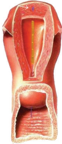
FIGURE 2: Illustration of the frameless GyneFix IUD anchored in the fundus of the uterus (see arrow). The anchoring knot is inserted in the fundus with a specially designed inserter.

the frameless IUD inserted in the uterus and Figure 3 shows the disparity in cavity width in two nulliparous women.