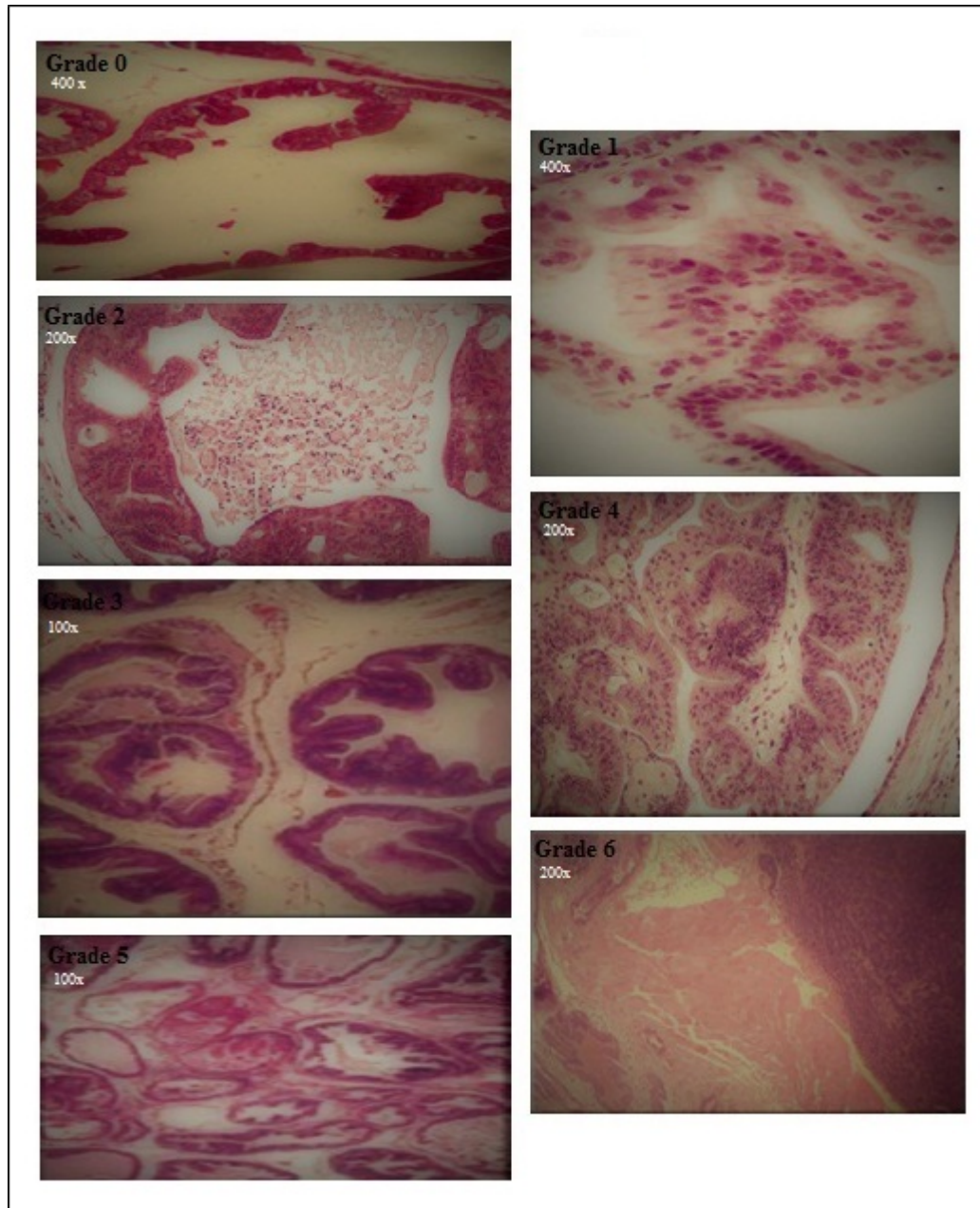
Figure 1: The original microscopic images for histology results of prostate. Grade 0: Normal epithelium. Grade 1: hyperplasia; Simple flat lesions. Grade 2: hyperplasia; Papillary or cribriform structures. Grade 3: hyperplasia; Papillary or cribriform lesions which protrude into lumen. Grade 4: adenoma; Lesions in which the lumen of acinus is completely filled with epithelium. Grade 5: adenoma; Lesion with a distinct epithelial mass within the lumen. Grade 6: adenocarcinoma, unwell differentiated epithelium with local invasion seems in the lesion.

the microscopic observations. Aerobic training alone didn't show a significant change in this regard. These microscopic observations are inconsistent with the results of pro-oxidant-antioxidant balance (PAB). PAB results were only significantly higher in the PC and PC+EXR groups when compared