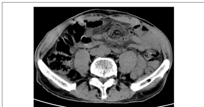
FIGURE 2 | CT of the abdomen on re-admission, the red arrow indicates the “vortex sign” that marks volvulus.