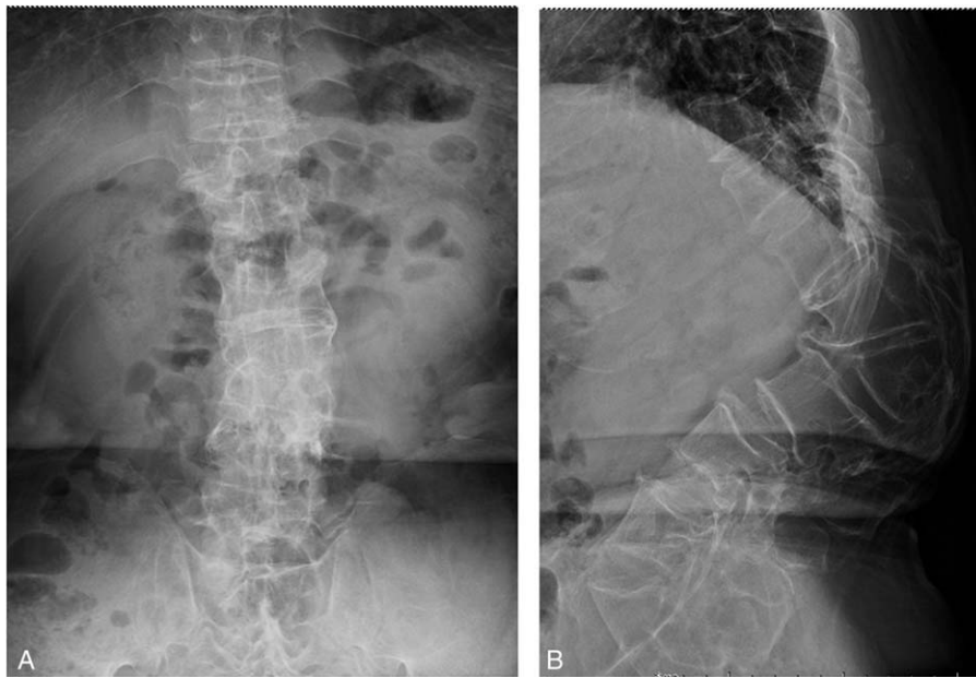
Figure 1. Preoperative anteroposterior and lateral radiographs of the thoracolumbar spine. Preoperative anteroposterior radiographs demonstrate a decreased interpedicular distance. Preoperative lateral radiographs show L2 anterior wedge deformity, fusion of the anterior area from the L1 to L3 vertebrae, and thoracolumbar kyphosis ( 105^\circ , L1–L3).

kyphosis with lumbar spinal canal stenosis in an adult with achondroplasia.