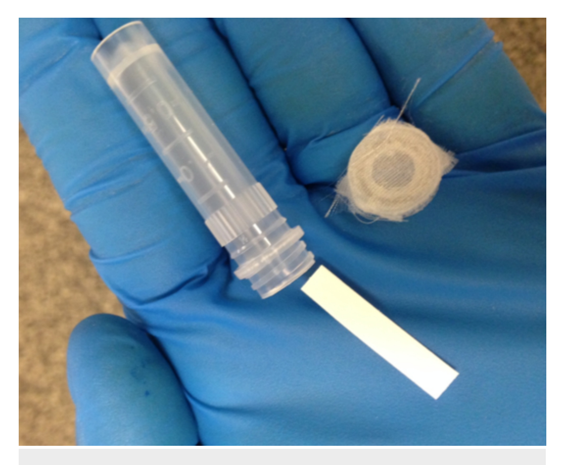
FIGURE 1: An example of a test tube that would contain the

Mixed inbreeding populations of the Fort Dix-Harlan strain and Ridge strain of C. lectularius L. were used in the experiments. The numbers of nymphs and adult bed bugs were not held constant, to mimic a natural population. Bed bugs were prepared and fed as described previously [11,12,15]. Bed bugs were kept in 2-mL microcentrifuge tubes containing a piece of paper on which the insects gathered (Figure 1).