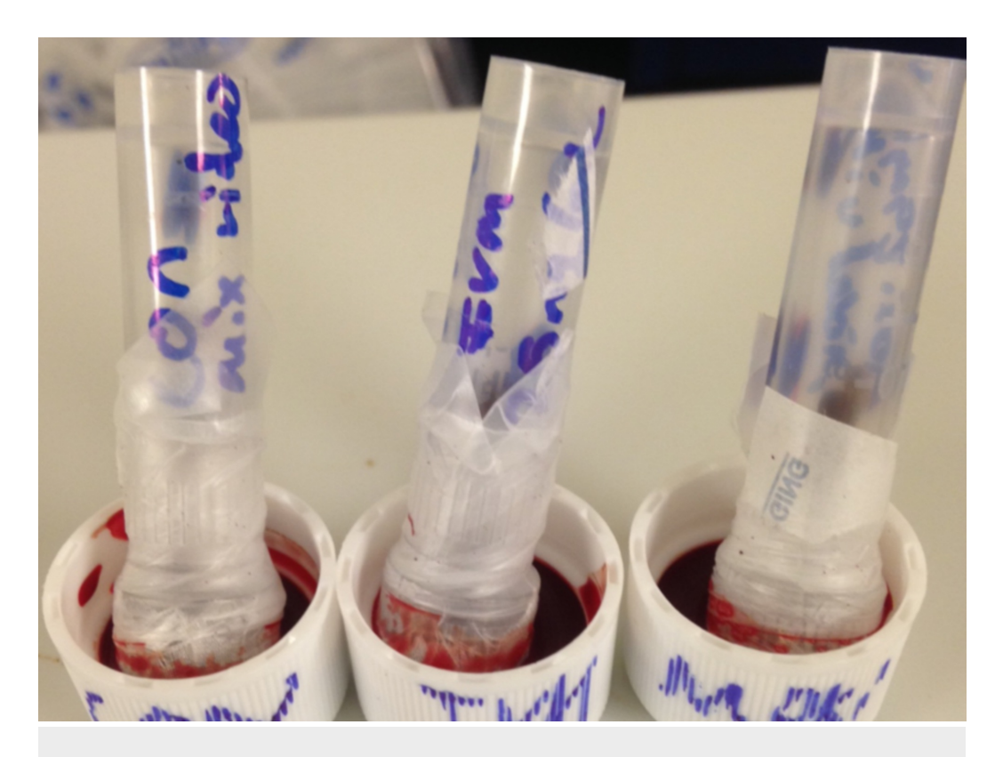
FIGURE 2: An example of bed bugs feeding on warmed blood

A 1/4-inch hole was drilled in the top of each centrifuge tube cap, and a piece of sheer fabric was glued to the surface, which was then covered with parafilm (Figure 2). Inverting this tube into warm blood allowed the bed bugs to feed (Figure 2).