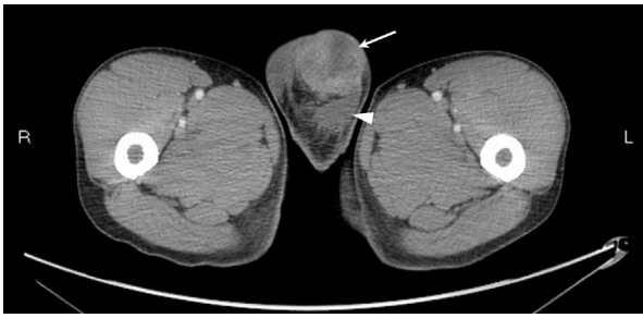
Figure 1. Pelvic CT scan showing heterogenous tumor in left scrotum (arrow) and left testis (arrowhead).

were positive for synaptophysin. Ganglioneuroma was taken into consideration. Consequently, a malignant ectomesenchymoma was more likely based on the combined pathologic findings mentioned above (Fig. 2).