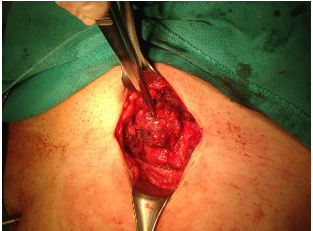
FIGURE 1: Intraoperative image showing the endometrioma in the subcutaneous tissue of the abdominal wall.

A 36-year-old female patient presented for recurrent abdominal pain and her past medical history was negative except for a cesarean delivery several years prior to her presentation. The pain was localized to the lower abdomen, crampy, cyclic, and worsened over the last few months. This pain was partially relieved by taking some analgesics. Hormonal therapy was afterwards tried for a month by taking progestins. The patient was no longer able to function properly in her daily tasks due to the pain. A physical exam revealed a slightly tender, non-mobile firm mass near the cesarean scar. A probable diagnosis of abdominal wall endometriosis was made. A computed tomography (CT) scan of the abdomen and pelvis with intravenous contrast revealed evidence of a homogeneous mass at the anterior abdominal wall just at the previous cesarean section showing slight enhancement. Under general anesthesia, surgical exploration (Figures 1, 2) revealed a 3×3 cm mass at the right lower rectus wall, and en bloc excision of the mass was performed (Figure 3). A pathologic examination showed pieces of benign thick fibrous tissue with multiple endometrial glands and stroma, diagnostic for endometriosis. The patient was seen at a regular interval, up until two months of follow-up and she was symptom free.