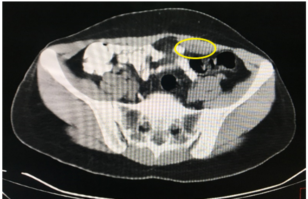
FIGURE 4: Computed tomography scan showing the endometrioma (yellow circle) contained in the rectus muscle, marked by a hypodensity lesion.

A 40-year-old female patient presented with the same clinical presentation of cyclic pain and her past history was negative except for a cesarean delivery several years ago. She noted that the pain was more at the left rectus muscle (away from the cesarean scar). She consulted her obstetrician at first who opted for medical treatment with analgesics and hormonal therapy (oral contraceptives and gonatropin-releasing hormone agonist), which were ineffective for her pain. A diagnosis of endometriosis was confirmed by an ultrasound and CT scan that showed a mid-rectus lesion (Figure 4). She underwent excision of the mass and mesh reinforcement was performed. Pathology confirmed the presence of endometrial stroma. The patient was disease-free and seen regularly up until a two-month interval.