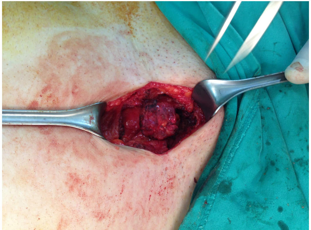
FIGURE 2: Intraoperative image showing the endometrioma in the subcutaneous tissue of the abdominal wall.