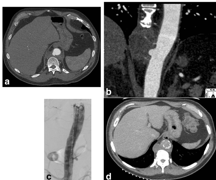
Fig. 1 Sixty seven year old male with mycotic aneurysm of the thoracic aorta. a Axial and b coronal images show enhancing, multiseptated, and lobulated low density mass within the lower retrocrural space/posterior mediastinum that abuts the adjacent thoracic aorta along 180 degrees of contact. Focal outpouching of the descending thoracic aorta at this site is consistent with a pseudoaneurysm. c Post stent graft deployment angiogram and d CT show satisfactory placement of the stent graft with no residual pseudoaneurysm or post procedural endoleaks

Patient B was a 67-year-old male who presented to ED with weight loss and night sweats. His complete blood cell count was within normal limits. Serum C-reactive protein was elevated at 41.1 mg/L. He had received fifteen intravesical BCG instillations for his low-grade papillary urothelial carcinoma and his last BCG instillation was 4 months prior to his ED presentation. His medical profile was otherwise negative apart from a remote uncomplicated appendectomy. Outpatient abdominal ultrasound was suspicious for periaortic lymphadenopathy. Follow-up CT scan of the abdomen and pelvis showed a centrally low density and peripherally enhancing periaortic collection measuring up to 5 cm × 1 cm × 4.6 cm in the infrarenal region. At this level, a focal outpouching arising from the aorta posteriorly measuring up to 0.8 cm × 2.2 cm × 0.9 cm (APxTRVxCC) was suspicious for a mycotic aneurysm (Fig. 2). A percutaneous CT-guided biopsy of the periaortic collection demonstrated necrotizing granulomatous inflammation, highly suspicious for BCGosis. This patient's mycotic aneurysm was treated with a surgical resection of the infected infrarenal aortic segment and repaired using an autologous graft harvested from the patient's left femoral vein. He had an uneventful postoperative course in the hospital and was discharged on a standard antituberculosis medication regime including isoniazid, rifampin, pyrazinamide, ethambutol, and Vitamin B6. Patient has