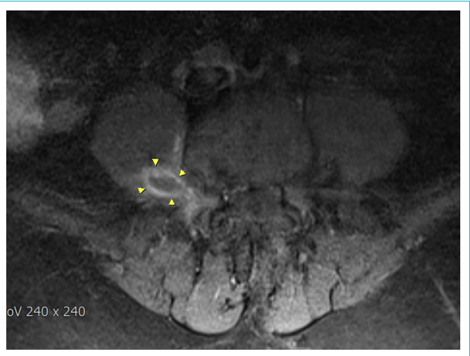
Figure 2. Lumbar MR axial section T1 Fat-suppressed imaging.

These findings were evaluated to be compatible with acute-subacute neurogenous involvement of the muscles innervated by the L2-L3-L4 segment on the right. As a result of MR neurography; there were peripheral T2 hyperintense edema areas around the right L4 nerve and it was found to be compatible with neuritis.