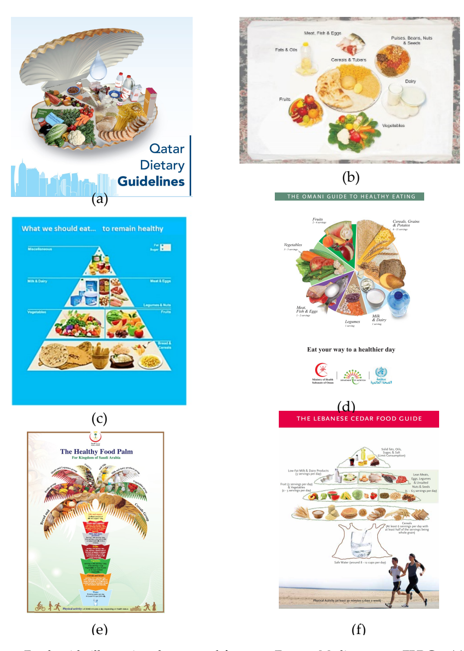
Figure 3. Food guide illustration shapes used for some Eastern Mediterranean FBDGs. (a) Qatar; (b) Afghanistan; (c) Iran; (d) Oman; (e) Kingdom of Saudi Arabia; (f) Lebanon.

vitality, growth and prosperity and has a huge cultural influence in the Arab world; it is also part of the national flag of Saudi Arabia. Oman and Qatar use a circle as a food guide pictorial representation. The Omani Healthy Plate is the visual representation of the "Omani Guide to Healthy Eating." The Omani FBDGs are set as nine Key Guidelines addressing people older than two years and focusing on adequate nutrition and NCD prevention. The plate is divided into six different coloured sections whose area is proportional to the recommended consumption. A bottle of water encourages non-caloric fluid intake. The Qatar food guide is a shell-shaped plate containing six food groups. The area of each food section is proportional to the recommended amount for a healthy diet; a drop of water symbolizes the importance of water consumption and hydration. Afghanistan uses a tablecloth with seven food plates. The largest plate at the centre represents the main food group, consisting of cereals and tubers.