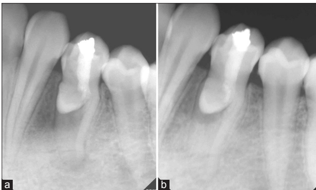
Figure 3: Post operative radiographs at 12 months (a) and 18 months (b) exhibited complete resolution of both peri-radicular and peri-apical radiolucencies

DE develops due to an abnormal proliferation and folding of a portion of the inner enamel epithelium and subjacent ectomesenchymal cells of the dental papilla into the stellate reticulum of the enamel organ during the bell stage of tooth formation. [10] It causes occlusal interference and/or devitalization of the involved tooth and shows a sexual predilection for females. There are different classifications given for the morphological variations of DE and its effect on the involved tooth. According to the Schulge classification, the presented case was Type V in which a tubercle arising from the occlusal surface obliterated the central groove. [2] According to the classification given by Levitan and Himel, it was Type V because of necrotic pulp and mature apex. [11] Tooth #34 became nonvital because microscopic pulp exposure in the tubercle area facilitated chronic bacterial invasion.