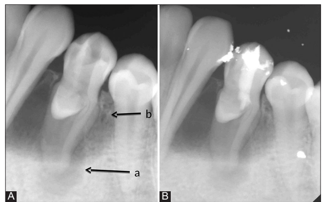
Figure 2: (A) Tooth #34 showing well-circumscribed, periapical (a) and large cyst-like peri-radicular radiolucencies (b). (B) SealBio was done and coronal seal was completed using calcium sulphate-based cement (Cavit) and silver amalgam restoration