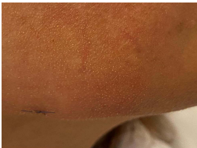
Figure 1 Facial follicular hyperkeratotic spicules on right anterior jaw line.

The patient reported with dry skin with numerous follicular hyperkeratotic spicules with a rough consistency in the anterior aspect of the right jaw and across the mid-zone that could be palpated on physical examination (Figure 1). During the two years of prior treatment, no skin biopsy had been performed, and the treatment plan had followed that typically prescribed for rosacea, ie, topical drugs. However, this had only slightly improved the patient's condition. Therefore, we performed a skin punch biopsy and sent the tissue for pathological analysis. A histological inspection of the tissue specimen revealed that the epidermis contained noticeable hair follicle dilatation and numerous Demodex mites extruding from the surface surrounded by a ring of dense homogeneous eosinophilic hyperkeratotic material.