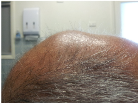
Figure 1 Metastatic brain lesion on examination. This image is a lateral photograph of the patient's skull demonstrating the palpable swelling found on physical examination. It demonstrates the extracranial extension of the intracranial metastatic lesion.