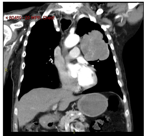
Figure 4 Coronal chest computed tomography slice. This image is a coronal slice of the chest computed tomography taken of the patient. It demonstrates a large squamous cell carcinoma of the lung in the left upper lobe.