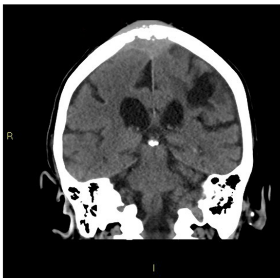
Figure 2 Chest X-ray. This is a posteroanterior chest X-ray taken of the patient at the time of diagnosis. It demonstrates the opacity in the left upper lobe of the lung consistent with lung cancer.

obstruction and compression of second order bronchi. No lymphadenopathy was noted. The head CT demonstrated a destructive lesion along the vertex of the parietal bone measuring 14mm transverse and 44mm anteroposterior. There were soft tissue components extending intracranially and extracranially. The intracranial component had a maximum thickness of nine mm and had a mass effect on the