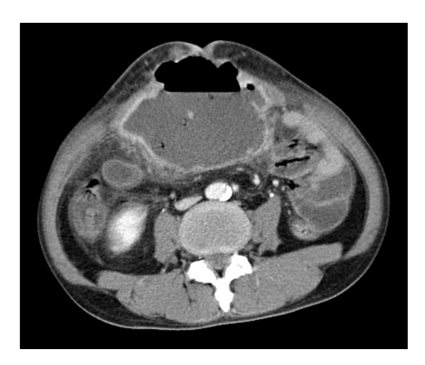
Fig. 1. Computed tomography showed huge abscess containing fluid and gas below umbilicus.