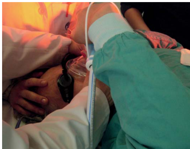
FIGURE 1: Conscious sedation with inhaled 50% nitrous oxide/oxygen premix during PDT session

When inhaled, a ready-to-use medical gas mixture consisting of 50% nitrous oxide and 50% oxygen