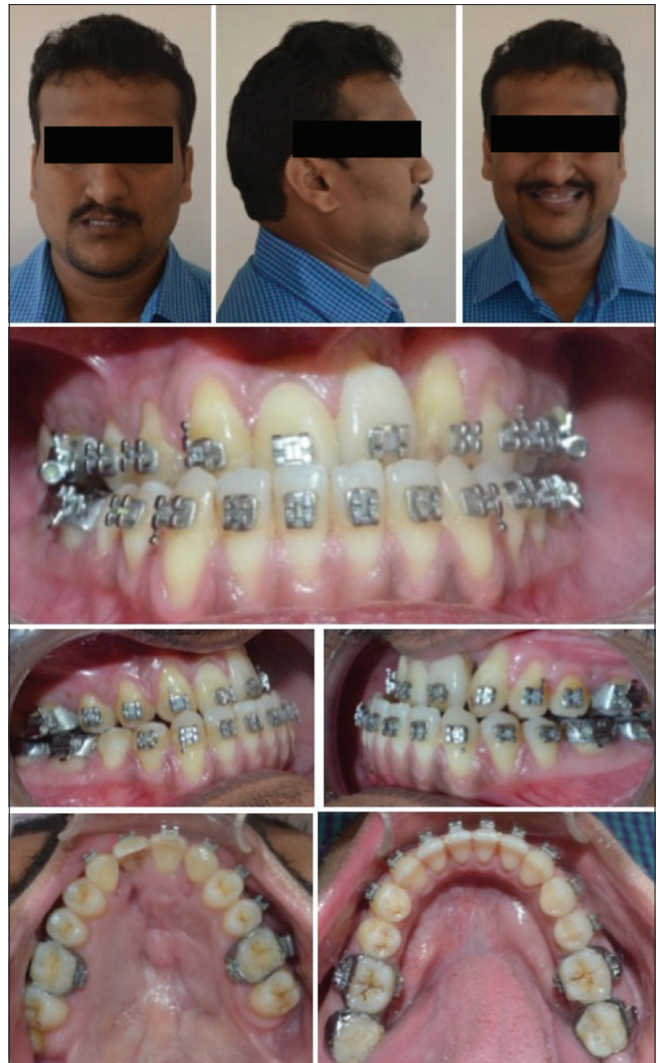
Figure 2: Presurgical extraoral (frontal, profile, smiling view) and intraoral (frontal, right lateral, left lateral, maxillary and mandibular occlusal views)

Oral examination revealed good oral health with no periodontal problems. Repaired CLP were seen on the left side with supernumerary teeth in the palate. 22 was missing in the maxillary arch, while 21 was malformed and distally tipped. 23 and 12 were palatally placed due to the constricted maxillary arch. Mild crowding was seen in the lower arch due to retroclination of the lower incisors. Anterior and posterior crossbites were seen and no open fistula was present. The maxillary arch was asymmetrical, while the mandibular arch was symmetrical. Interarch relationship showed a reverse overjet of 6 mm and a reverse overbite of 10 mm with overclosure. Maxillary dental midline was deviated to