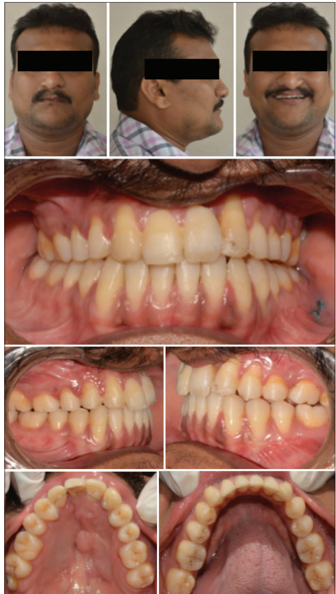
Figure 4: Posttreatment extraoral (frontal, profile, smiling view) and intraoral (frontal, right lateral, left lateral, maxillary and mandibular occlusal views)

Like most cleft patients, the patient displayed a maxilla deficient in all the three planes of space along with mid-face deficiency. However, considering the fact that