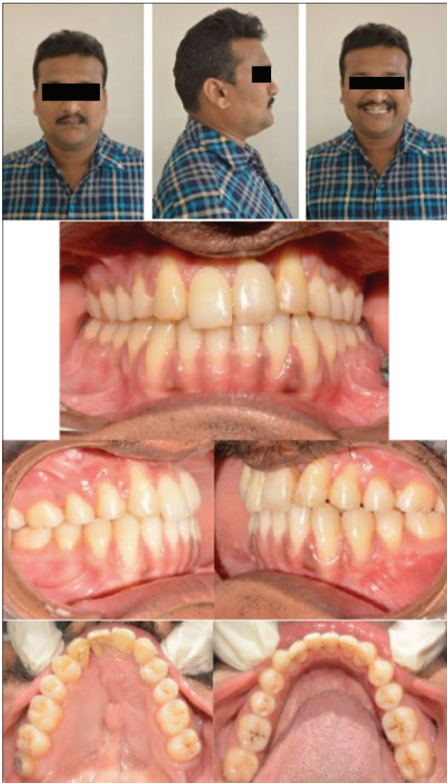
Figure 5: One-year retention photographs (frontal, profile, smiling view) and intraoral (frontal, right lateral, left lateral, maxillary and mandibular occlusal views)

individual jaw bases. It was decided to substitute the canines for the lateral incisors in this case. Proclination of the lower anteriors was required [Figure 2].