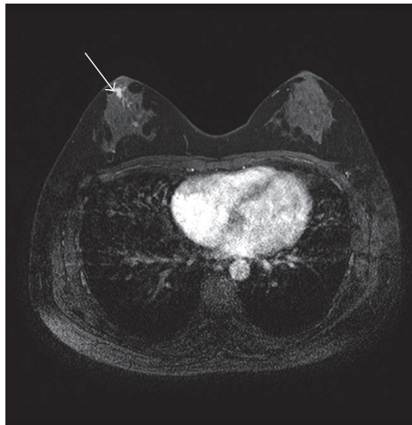
FIGURE 4: A 41-year-old woman with ductal carcinoma in situ. Background parenchymal enhancement (BPE) is scored as minimal. The tumor (arrow) shows the variance of signal intensity, mean and variance of gradient, and entropy LH and HL higher than their highest values of BPE.

Strong BPE can interfere with the identification of DCIS [3, 4], and marked or moderate BPE may be one of the risk factors for breast cancer [5, 6]. Thus, quantitative assessment of BPE is required to support the visual scoring of BPE. In the present study using TA, the variance of SI, variance of gradient, and EnLH were significant discriminators between the moderate BPE and the mild or minimal BPE. Among these parameters, the SI variance provided the perfect cutoff value for distinguishing between them. The variance of SI