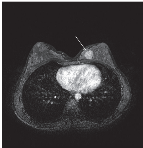
FIGURE 1: A 32-year-old woman with fibroadenoma. Background parenchymal enhancement (BPE) of the right breast is scored as moderate, while that of the left breast is scored as mild. Texture analysis (TA) reveals that the variance of signal intensity (SI) is 356.7 for the right breast and 310.5 for the left breast. A fibroadenoma is hyperintense to BPE (arrows).

BPE: background parenchymal enhancement, SI: signal intensity, and En: entropy; *the variance of SI was significantly greater in the moderate BPE than in the mild and minimal BPE ( P < 0.01 for both). **The variance of gradient and EnLH were also significantly greater in the moderate BPE than in the mild ( P < 0.05 for both) and minimal BPE ( P < 0.01 for both). ***The skewness of SI was significantly greater in the moderate and mild BPE than in the minimal BPE ( P < 0.01 for both). ****The mean of gradient and EnHL were significantly greater in the moderate BPE than in the minimal BPE ( P < 0.05).