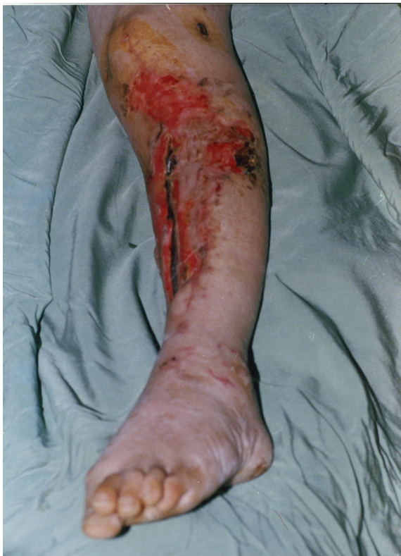
Fig. 1: A 34-year-old man had large open tibial wound in the junction of the middle and distal thirds of the leg with an exposed tibial bone after debridement.

The method involved was marking the sural flap with maximum soft tissue that we can harvest. Total belly of soleus and reverse