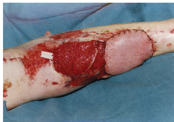
Fig. 4: Coverage of defect with a combined soleus and sural muscle flap.