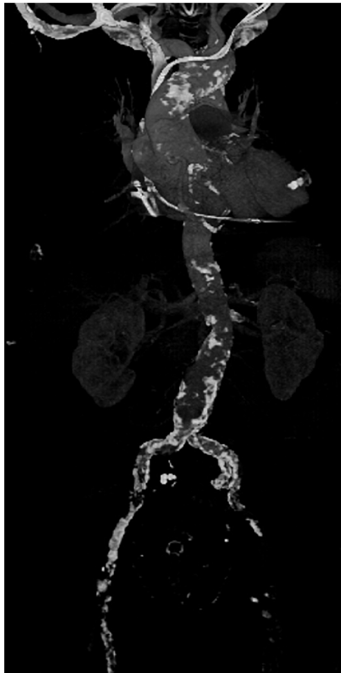
FIGURE 2 Example of a computed tomography (CT) scan of the aorta of a patient with severe arteriosclerosis in the axillary artery, aortic arch abdominal aorta and especially the femoral vessels in which minimally-invasive surgery was performed by using an antegrade arterial perfusion via arteria axillaris.

patients in group A suffered from infective endocarditis vs. one patient in the group F ( p = 0.075 ). Furthermore, three patients in group A had status post stroke vs. one patient in group F ( p = 0.306 ). Atrial fibrillation was present in 40% of the patients (group A: 54%; group F: 26%; p = 0.013 ), out of which 11 patients had paroxysmal or persistent atrial fibrillation. Left ventricular ejection fraction at baseline was significantly lower in group A vs. group F ( 49.0\% \pm 9.3\% vs. 55.4\% \pm 8.1\% , respectively, p = 0.001 ). Perioperative risk score values were significantly higher in group A vs. group F [EuroSCORE II: 3.9 \pm 2.5 vs. 1.6 \pm 1.5 ; p = 0.001 ; Society of Thoracic Surgeons (STS)-Score: 2.19 \pm 1.49 vs. 1.31 \pm 0.64 ; p = 0.023 ].