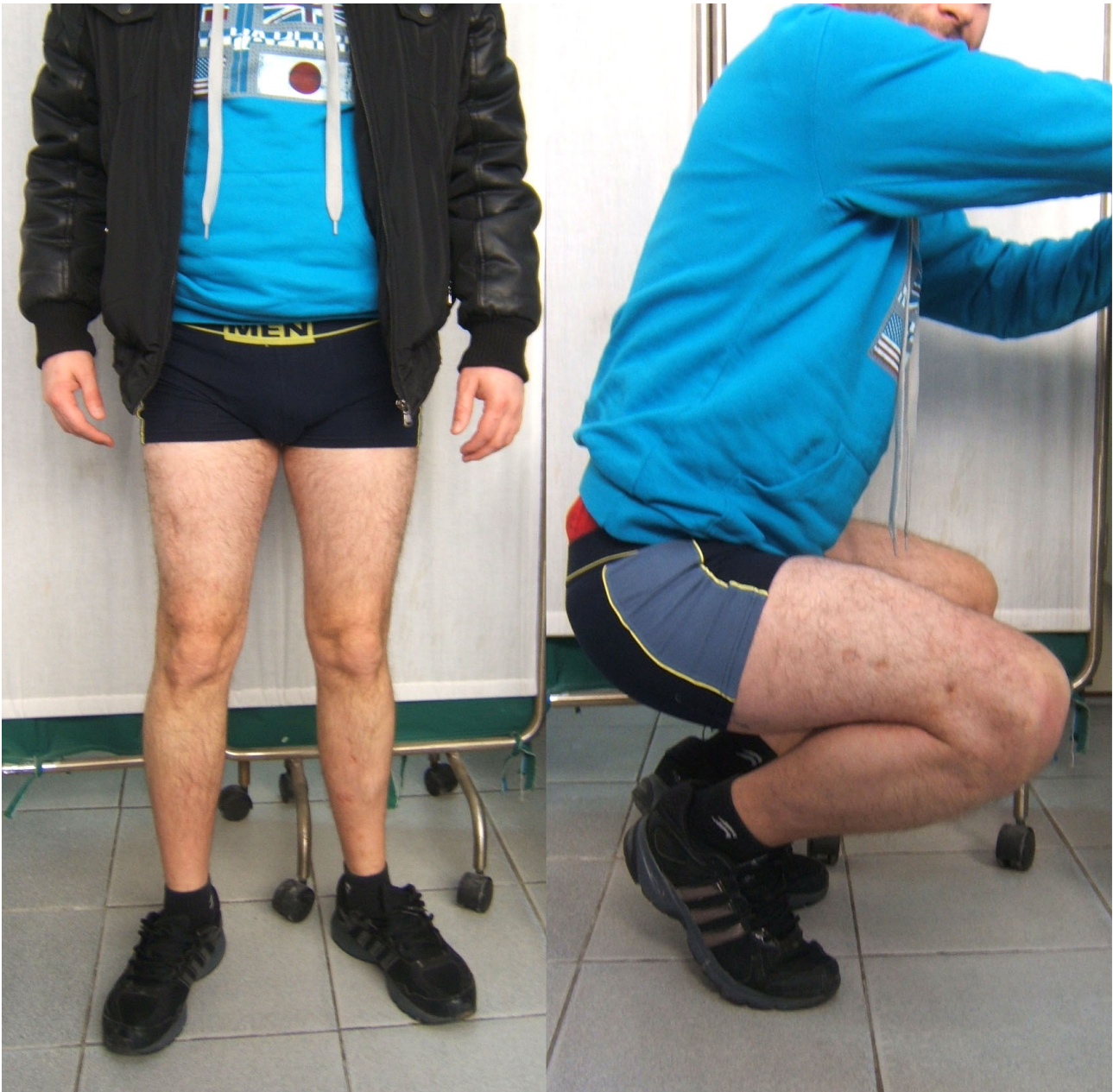
Fig. (3). Clinical views of the same patient six months post-operatively. Note the complete length restoration and the complete range of motion of the knee.