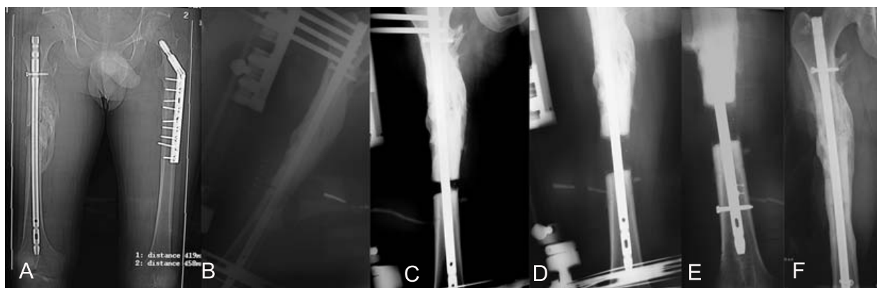
Fig. (1). (A) A 21-year-old man with 39mm post-traumatic shortening after intramedullary (IM) nailing of the right femur. Note successful bony union with no length discrepancy of the left femur. (B) Immediate post-operative anteroposterior (AP) x-ray showing the application of the hybrid external fixator parallel to the knee joint and to the nail. (C) Twenty days post-operatively AP x-ray showing progression of distraction. (D, E) Intraoperative x-ray after completion of the 39mm lengthening and insertion of locking screws and removal of the external fixator. (F) AP x-rays 6 weeks after insertion of interlocking screws. Note complete bony union.

Pre-operative planning involved accurate assessment of the Leg-Length Discrepancy (LLD) with assisted computed tomography scanogram (Fig. 1). Careful soft-tissue evaluation and laboratory blood tests (ESR, CRP) were also performed in order to exclude any possibility of infection.