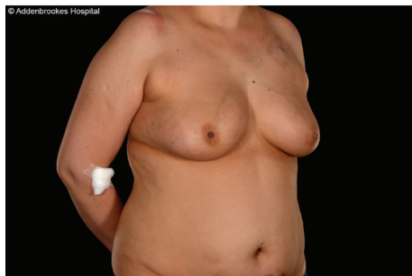
FIGURE 3: Preoperative photograph of a 37-year-old female (Patient 3) showing bilateral lower abdominal skin bruising at the sites of heparin injection prior to right mastectomy and DIEP flap reconstruction.