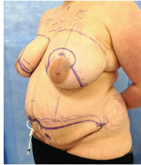
FIGURE 1: Preoperative photograph of a 33-year-old female (Patient 2) showing skin bruising on the left lower abdomen prior to bilateral mastectomy and DIEP flap reconstruction.

2.3. Patient 3. A 37-year-old female with a grade II invasive ductal carcinoma developed a left subclavian port-related thrombosis one month after the start of 6 cycles of primary chemotherapy and was started on a course of therapeutic