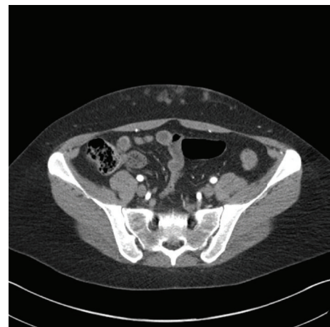
FIGURE 4: CT angiogram of Patient 3 showing multiple small subcutaneous haemorrhages bilaterally at the sites of heparin injections. DIEP branches appear intact in adjacent fat. The inferior epigastric arteries are seen running posterior to the rectus muscle and sheath.