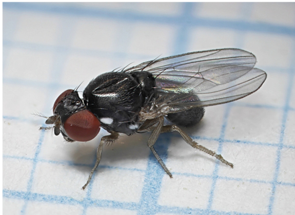
Figure 2 Amiota filipes . Adult of Amiota filipes Máca. Most of the Amiota species are black or brown with silvery spots on face, postpronotum and katapisternum. Original, courtesy K. Nielsen.