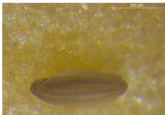
Figure 5 Phortica variegata , egg. Like in other Steganinae, the egg possesses a pair of longitudinal vela, as opposed to Drosophilinae which presents filamentous processes. Both serve to extend the surface of the egg and enhancing oxygen supply.

Undoubtedly, various aspects of the natural history of Steganinae need to be elucidated, mostly in relation to the extent of zoophagous behavior in various genera. Refined data on this taxon of drosophilids could prove useful to the biological control of phytophagous pests from the order Homoptera, as an alternative to chemical treatment. The rare experiments carried out in this field have