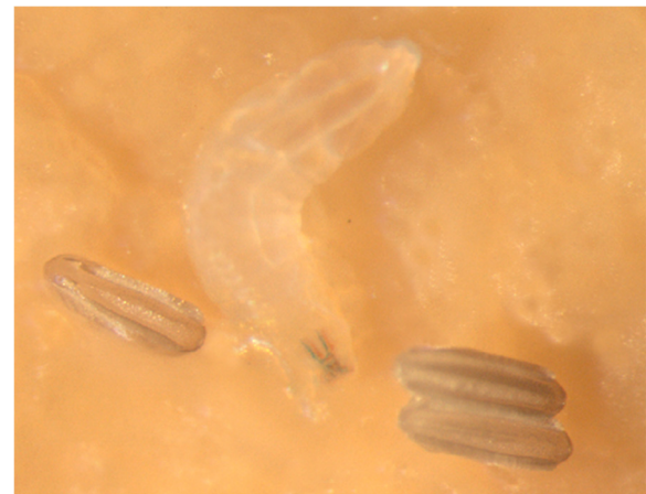
Figure 6 Phortica variegata , eggs and first instar larva. A rare picture of the artificial breeding of Phortica .

been referenced [12,67]. From a parasitological perspective, the reasons for the lachryphagy of adult insects remain yet to be elucidated, although the need for protein is most likely the main driver for this. Similarly, the possible role of sodium ions in this process also requires study.