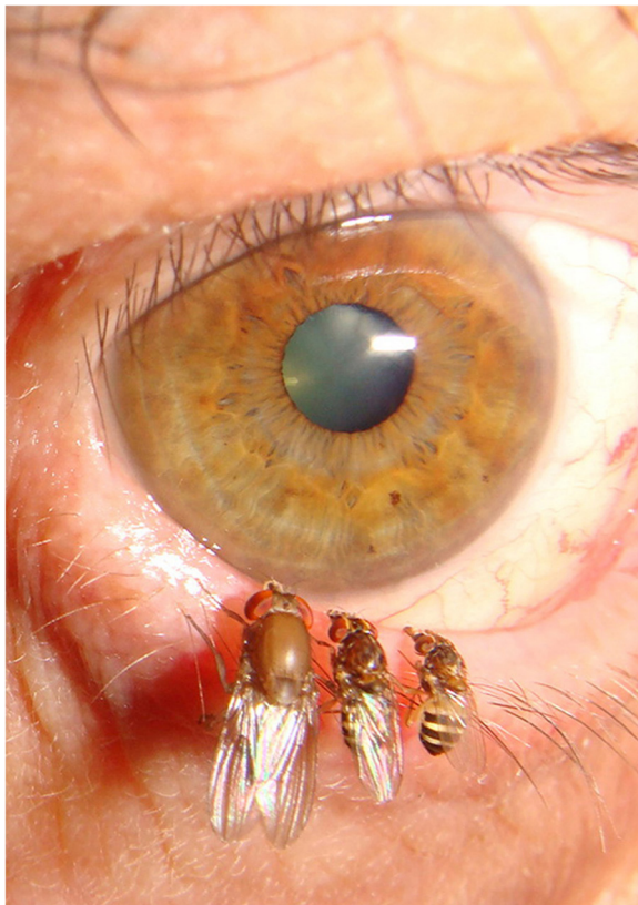
Figure 3 Drosophilids at human eye in Thailand. Three fruit flies ( Drosophilidae ) sipping tears from the human eye. Left: female Apsiphortica longiciliata Cao & Chen (females are very rarely lachryphagous); center: male Phortica pseudotau (Toda & Peng); right: male Phortica sp. (Photo H. Bänziger, from Bänziger et al., 2009 [2]).

Amiota and its monophyly was confirmed by cladistic analyses [21-23]. Studies of the feeding habits of Phortica variegata confirmed previous observations, showing that whilst females prevailed on the fruit bait (male:female ratio 1:3.8), lachryphagous behaviour is exclusively by males [24]. Similar observations, although on smaller scale, exist in a number of other species of relevant genera. This behaviour is opposite to that of blood-feeding insects showing sex-related preferences (e.g., mosquitoes, ceratopogonids, sand flies, black flies and tabanids), where only adult females are haematophagous [25], with the remarkable exception of the hematophagous males of the genus Calyptra (Lepidoptera).