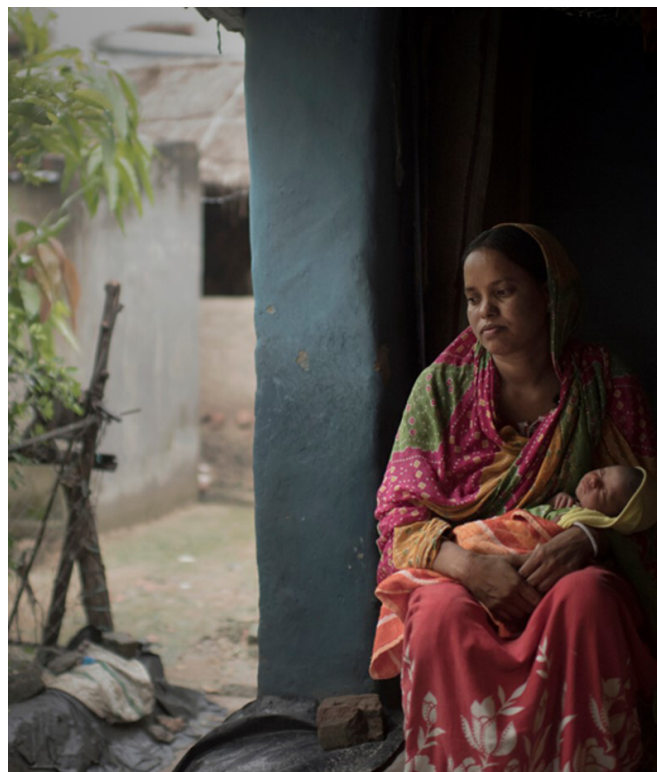
Figure 1 Many women face obstacles to seeking care in health facilities for themselves or their newborn baby (photo credit: Pieter ten Hoopen 2016; license for unrestricted use held by London School of Hygiene & Tropical Medicine (OMR Campbell and WJ Graham)).

The catalogue of problems highlighted in table 1 poses a huge dilemma for MNH care. Will deterioration of facility-based care shift the balance of risk to women and newborns from benefit to harm, so challenging the strategic recommendation for facility deliveries? If so, what choices are there for pregnant women and service providers? Should we revisit risk screening approaches and strengthen ANC so that women at lower risk can be advised to give birth in primary care facilities or in separate midwifery units? How can quality be maintained or improved? Once again, responses are emerging from reports on the ground; the final column in table 1 summarises some local solutions to context-specific problems from our online survey and webinar. Collectively, these local adaptations and responses may protect