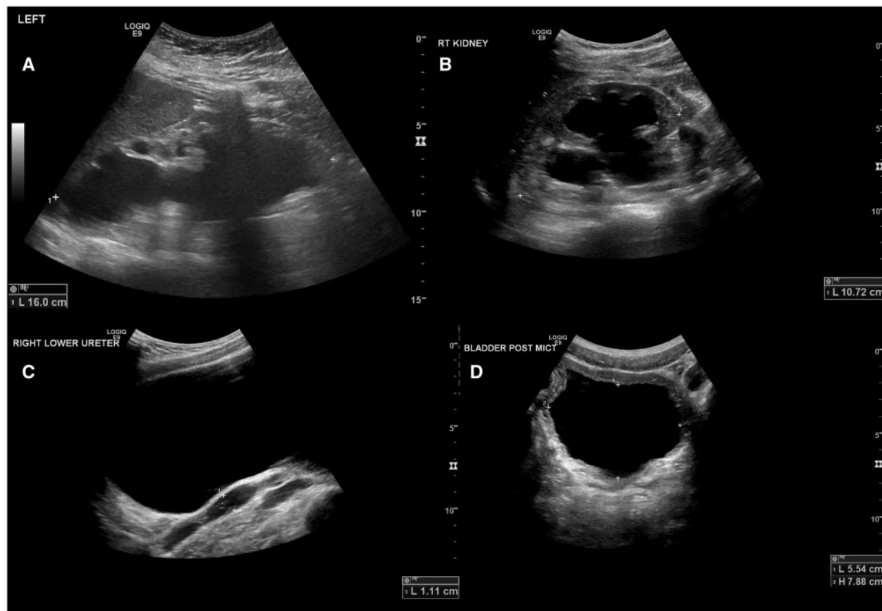
FIGURE 2: Examples of flow uropathy. Shown are ultrasound images detailing flow uropathy. (A) Marked hydronephrosis of single right kidney with loss of renal cortex in Patient 22 (at age 17 years). (B) Hydronephrosis, (C) Dilated bladder and ureter, (D) PVR in Patient 2.1 (all images at age 15 years). Hydronephrosis in this patient developed after the age of 8 years.