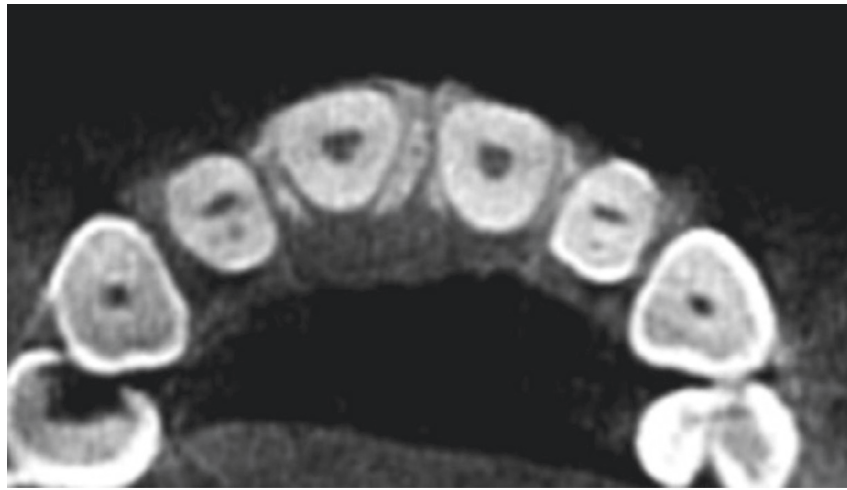
FIGURE 1: Example of bilateral invagination in lateral maxillary teeth (axial plane).