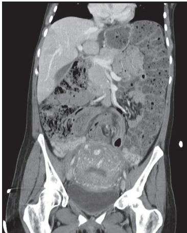
FIGURE 2: Computer tomography imaging with intravascular contrast performed on postpartum day 1. There is twisting of the mesentery and focal mesenteric edema in the mid lower abdomen. The findings are consistent with sigmoid volvulus.

underwent a second colonoscopy with decompression, with rectal tube left in place. At 38 1/7 weeks, she underwent a third colonoscopic decompression procedure, and the decision was made to proceed with delivery. Labor was induced, culminating in a spontaneous vaginal delivery of a healthy female infant. Unfortunately she again experienced worsening abdominal pain on the first day postpartum, with computer tomography imaging confirming sigmoid distention with recurrence of volvulus (Figure 2). A fourth colonoscopic decompression was performed, and she was discharged home on the second day postpartum. Symptoms again recurred on postpartum day 32 and were managed