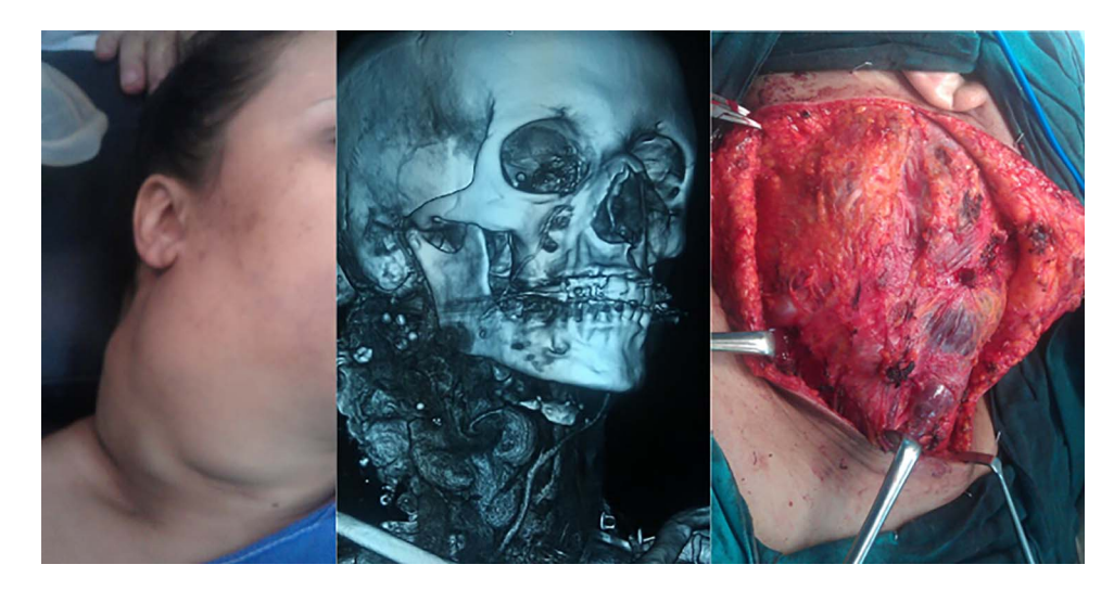
Figure 1: Patient #1 before surgery, magnetic resonance imaging, during surgery.

*High-flow lesions. CVM, combined vascular malformations; CLM, capillary lymphatic malformations; LVM, lymphatic venous malformation; CLVM, capillary lymphatic venous malformation; CAVM, capillary arteriovenous malformation.