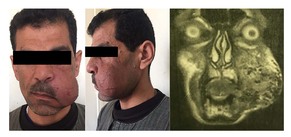
Figure 2: Patient #2 before surgery.