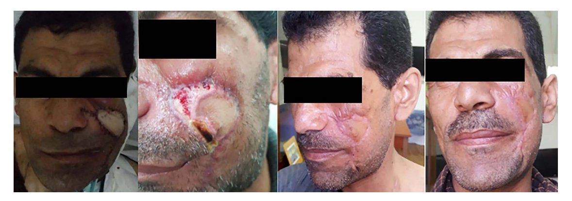
Figure 5: Patient #2 recovery.

to their morbidity. Lethal intraoperative exsanguination or sacrifice of vital structures (such as facial nerve) is not uncommon with sizable head and neck AVMs and must be considered preoperatively, and the patient must be well informed of the risks. Other life-threatening complications include ischemic brain injury, pulmonary embolism and compressive hematoma.