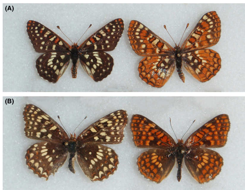
Figure 1. (A) (top row) Two predominant forms of Euphydryas chalcedona , black form (left), and red form (right). (B) (bottom row) Two predominant forms of Chlosyne palla , black form (left), and red form (right).