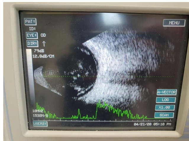
Figure 2 B-scan ultrasonography of the eye for the first case one day post-operatively showing vitreous hemorrhage and complete retinal detachment.

The wound was tested and found watertight and 0.1 cc of Vigamox 0.5% (Alcon, Geneva, Switzerland) was injected in the anterior chamber (AC) at the end of the surgery. At day one postoperative, a B-scan ultrasonography (Sonomed AB5500+ E-Z Scan, NY, USA) was performed. The B-scan revealed no lens in the vitreous body and a complete retinal detachment (RD) with vitreous hemorrhage (VH). The patient was referred to a vitreoretinal surgeon. Figure 2 Steroid (Pred Forte 1%, Allergan, Dublin, Ireland) and antibiotic (Vigamox 0.5%, Alcon, Geneva, Switzerland) eye drops were given four times/day in the first postoperative day. The antibiotic eye drops were stopped two weeks postoperative and the