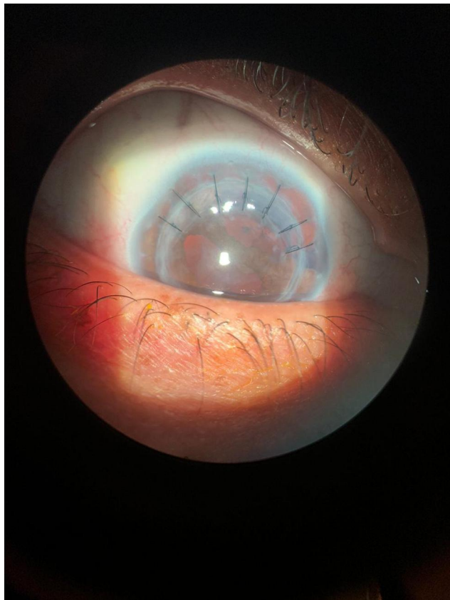
Figure 3 Slit lamp picture of the eye for the fourth case one week post-operatively showing seven 10/0 nylon stitches securing the area of donor-host junction dehiscence superiorly and a large iridodialysis superiorly and superionasally.

patient was aphakic with large iridodialysis. Figure 3 Fundus exam showed minimal VH but otherwise normal looking fundus. There was no evidence of any lenticular matter in the posterior segment, indicating the lens was expelled from the wound at the time of trauma. The plan in the last visit was to do iridodialysis repair and secondary scleral fixation IOL at a later occasion.