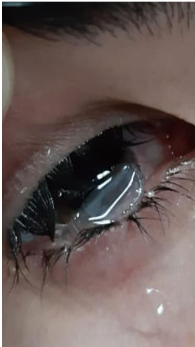
Figure 1 Picture of the eye at presentation in the first case showing dehiscence of the superior two thirds of the donor tissue from the host with eversion of the donor tissue downward resulting in the endothelial part of the graft facing away from the globe.

The wound was tested and found watertight and 0.1 cc of Vigamox 0.5% (Alcon, Geneva, Switzerland) was injected in the anterior chamber (AC) at the end of the surgery. At day one postoperative, a B-scan ultrasonography (Sonomed AB5500+ E-Z Scan, NY, USA) was performed. The B-scan revealed no lens in the vitreous body and a complete retinal detachment (RD) with vitreous hemorrhage (VH). The patient was referred to a vitreoretinal surgeon. Figure 2 Steroid (Pred Forte 1%, Allergan, Dublin, Ireland) and antibiotic (Vigamox 0.5%, Alcon, Geneva, Switzerland) eye drops were given four times/day in the first postoperative day. The antibiotic eye drops were stopped two weeks postoperative and the