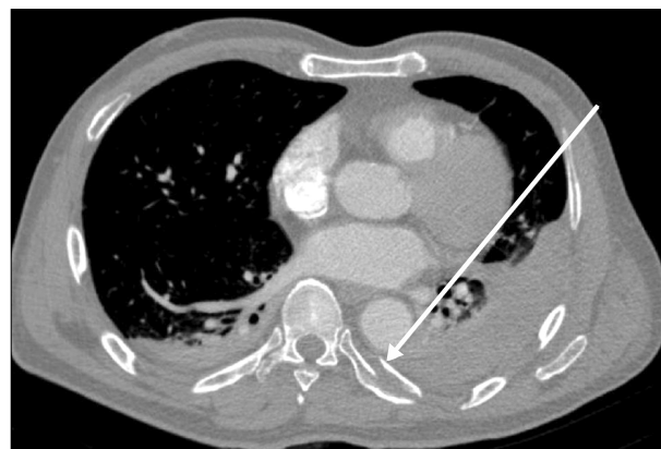
Fig. 2. Follow-up chest computed tomography, 4-post trauma day. Increased hemothorax (arrow: fractured fragment of 7th rib, nearly same plane to Fig. 1).