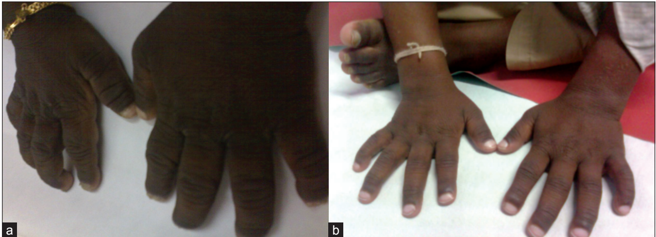
Figure 1: (a) Hands showing broad stubby fingers with grossly thickened, rough, and lichenified skin; (b) normal hands and fingers following biliary diversion