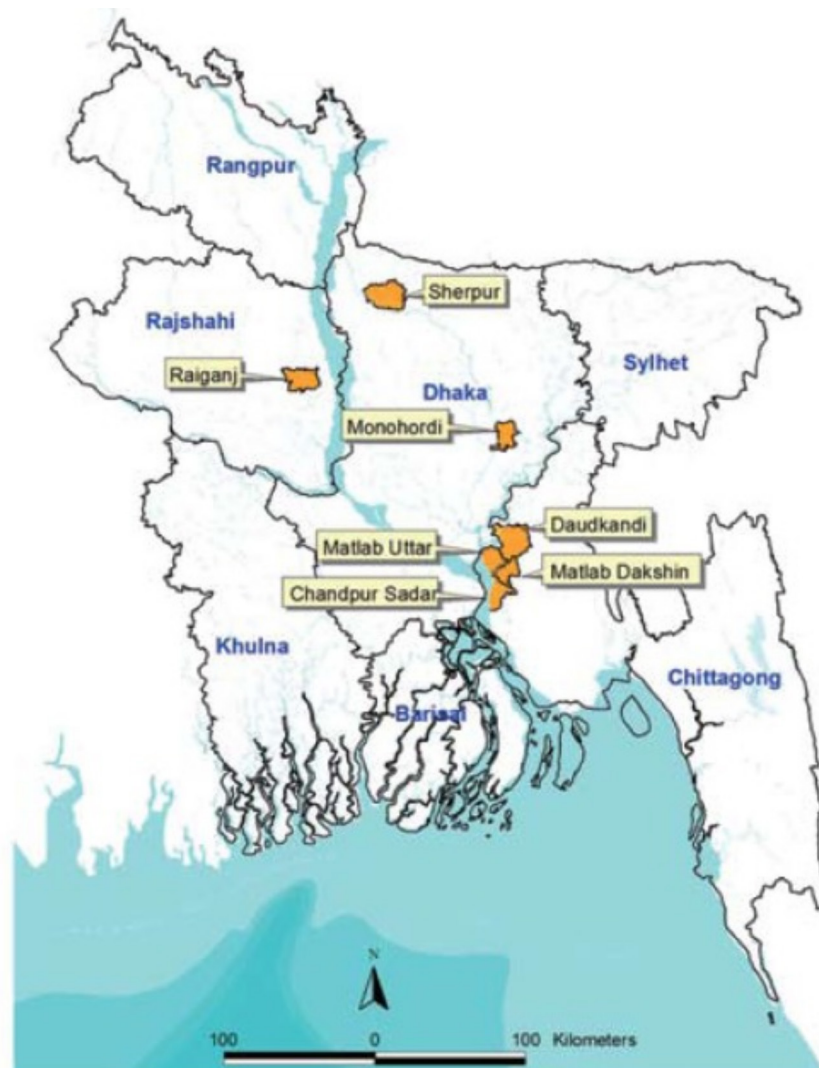
Figure 1 Map of Saving of Lives from Drowning study sites in Bangladesh. 14

This study used data from the Saving of Lives from Drowning (SoLiD) project, a household census and baseline survey conducted using a cross-sectional study design in rural Bangladesh between June and November 2013. Detailed description of the tool, data collection method and procedure for the SoLiD household survey has been previously reported. 7,12,13 The