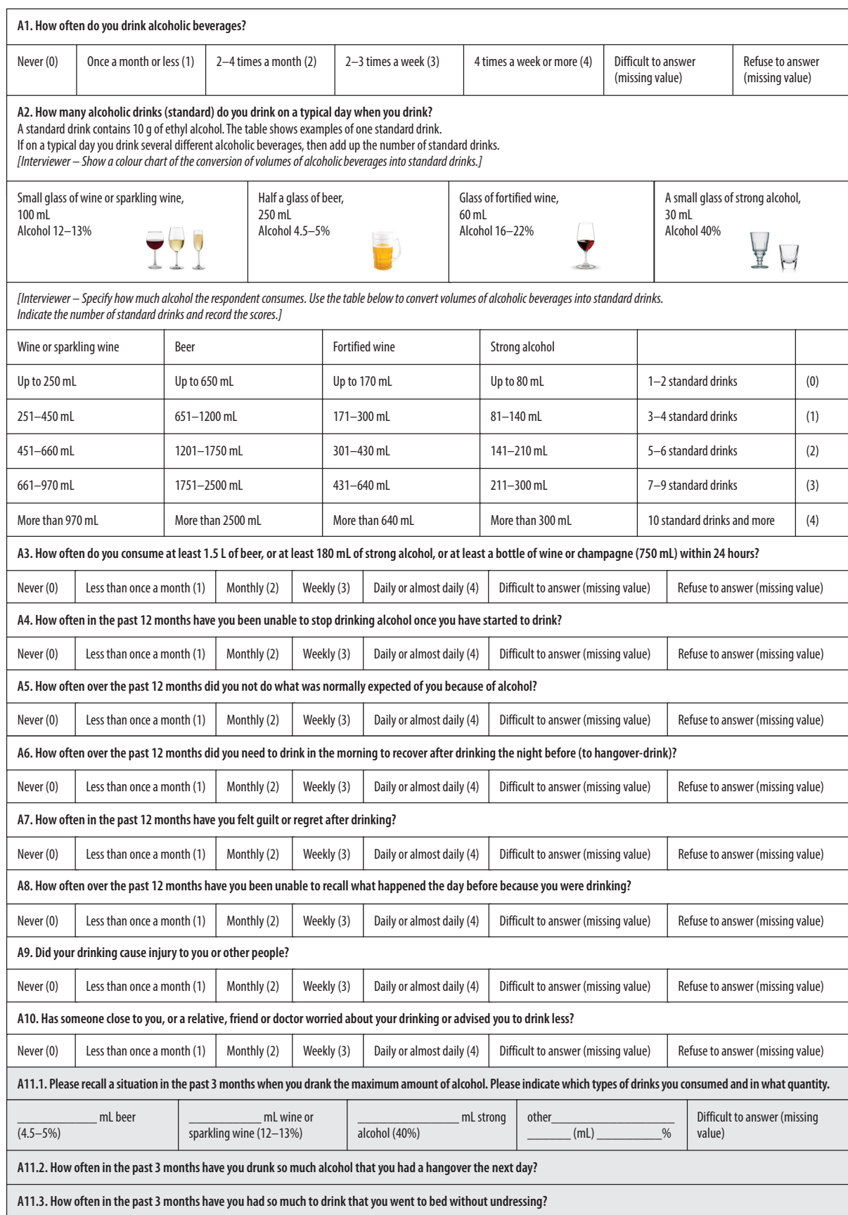
Fig. 1. Modified 13-item Russian Alcohol Use Disorders Identification Test for the validation study

RUS-AUDIT: Russian Alcohol Use Disorders Identification Test.