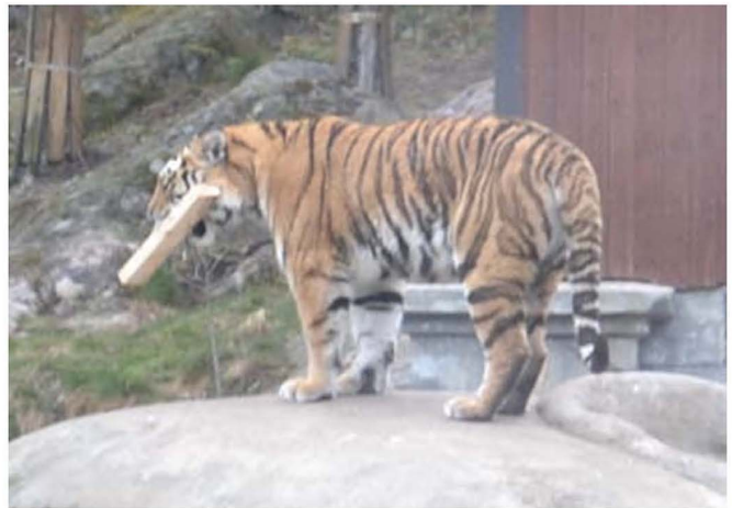
Figure 1. Some of the behaviors considered in the present study. upper left: an African wild dog ( Lycaon pictus ) sniffing at an odorized wooden log; upper right: two Asian wild dogs ( Cuon alpinus ) biting an odorized wooden log; lower left: a South American bush dog ( Speothos venaticus ) performing flehmen on an odorized wooden log; lower right: a Siberian tiger ( Panthera tigris altaica ) “toying” with (in this case: carrying) an odorized wooden log.