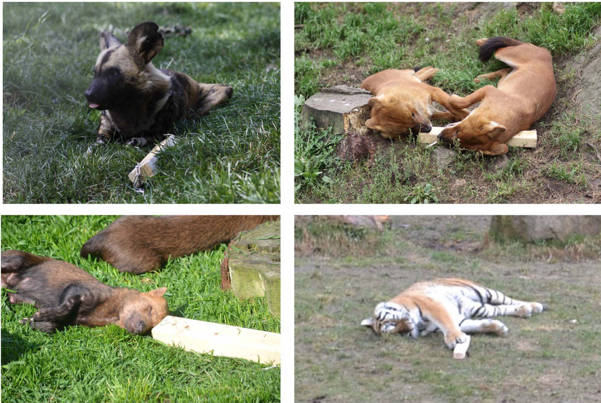
Figure 3. Guarding of or resting close to odorized wooden logs impregnated with either real blood odor or with the blood odor component trans-4,5-epoxy-(E)-2-decenal. upper left: an African wild dog ( Lycaon pictus ); upper right: two Asian wild dogs ( Cuon alpinus ); lower left: a South American bush dog ( Speothos venaticus ); lower right: a Siberian tiger ( Panthera tigris altaica ). doi:10.1371/journal.pone.0112694.g003

mammalian blood odor, not only in humans [15,16], but also in nonhuman mammals.