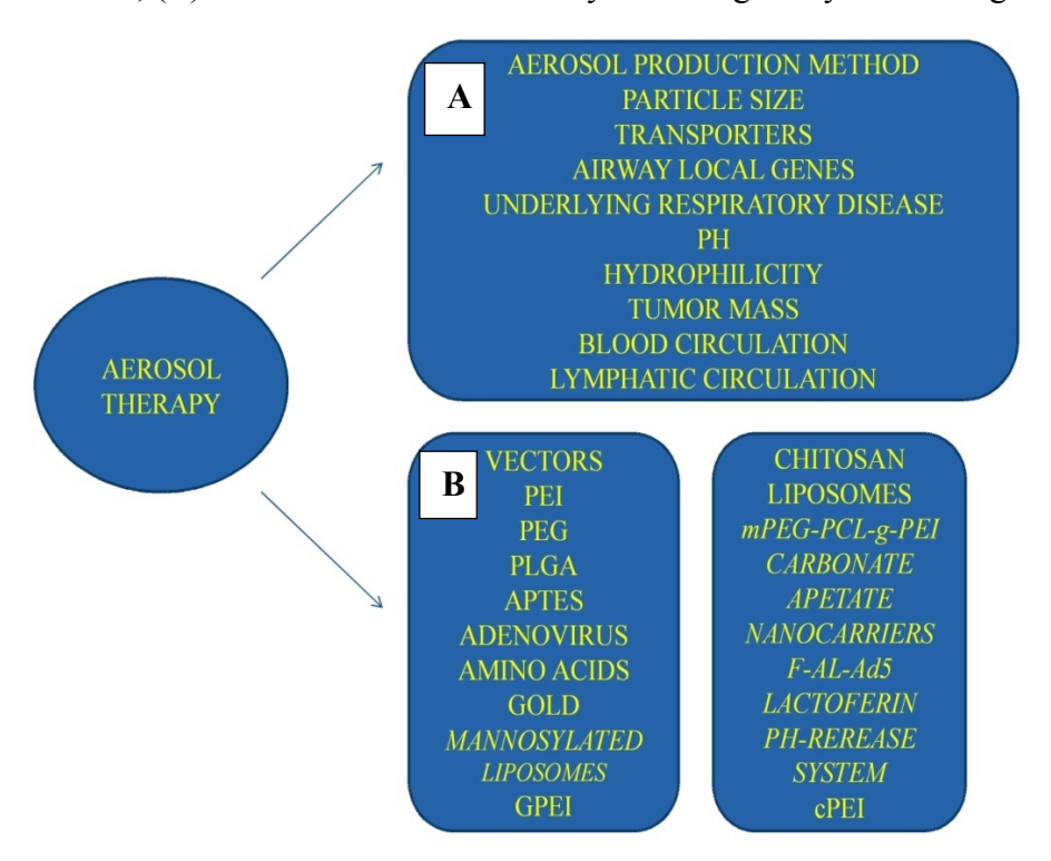
Figure 2. Aerosol gene therapy modality parameters; (A) formulation and lung microenvironment; (B) current and future vector systems. Figure by Paul Zarogoulidis.

It should be clarified that the reason we need local aerosol therapy for lung cancer is to deliver a smaller amount of therapeutic agent and therefore have less systemic side effects. In addition, micro-metastasis will be controlled either locally in the lung parenchyma, or in other organs through the vascular and lymphatic circulation of the chemotherapeutic agent [19]. Another aspect that should be incorporated in this section is the modification of the respiratory properties. It has been shown that the addition of 5%–7% CO<sub>2</sub> through the nebulization process (aerosol gene therapy) can decrease the respiratory rate and increase the tidal volume by 150% (deep breathing pattern) [60–64]. Nevertheless, a higher concentration can lead to dizziness and sleepiness [65]. Another option would be the nebulization of a drug formulation in heliox. This low-density gas mixture has the ability to reduce flow resistance, in consequence allowing more aerosol to be deposited in the alveoli region (Figure 2) [66]. The CO<sub>2</sub> has been co-administered in nebulized inhaled chemotherapy trials and inhaled gene therapy trials.