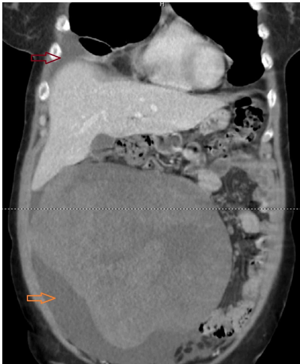
FIGURE 2: CT image, coronal view. A 21-cm abdominopelvic heterogeneous mass with clear borders and unclear origin – uterus versus ovary – is seen. Small amounts of peritoneal (orange arrow) and pleural fluid (red arrow) are observed. No lymphadenopathies were noted.

During the hospital admission, she reported increasing dyspnea due to accumulation of the pleural effusion that relieved after a therapeutic thoracentesis. A median laparotomy was performed. A 21-cm right adnexal solid mass with smooth and pearly appearance (Figure 3) and another 3-cm mass in the left ovary were noted and removed. The intraoperative pathologies of both masses were suggestive of ovarian fibroma, later confirmed by the examination of the whole piece. There were no other significant findings in the surgical exploration.