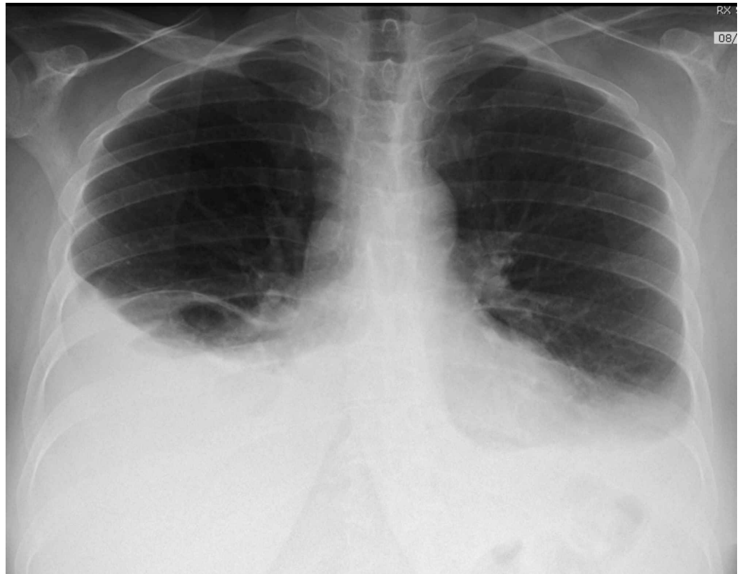
FIGURE 1: Chest X-ray. Bilateral pleural effusion distributed in a typical fashion, larger on the right side.