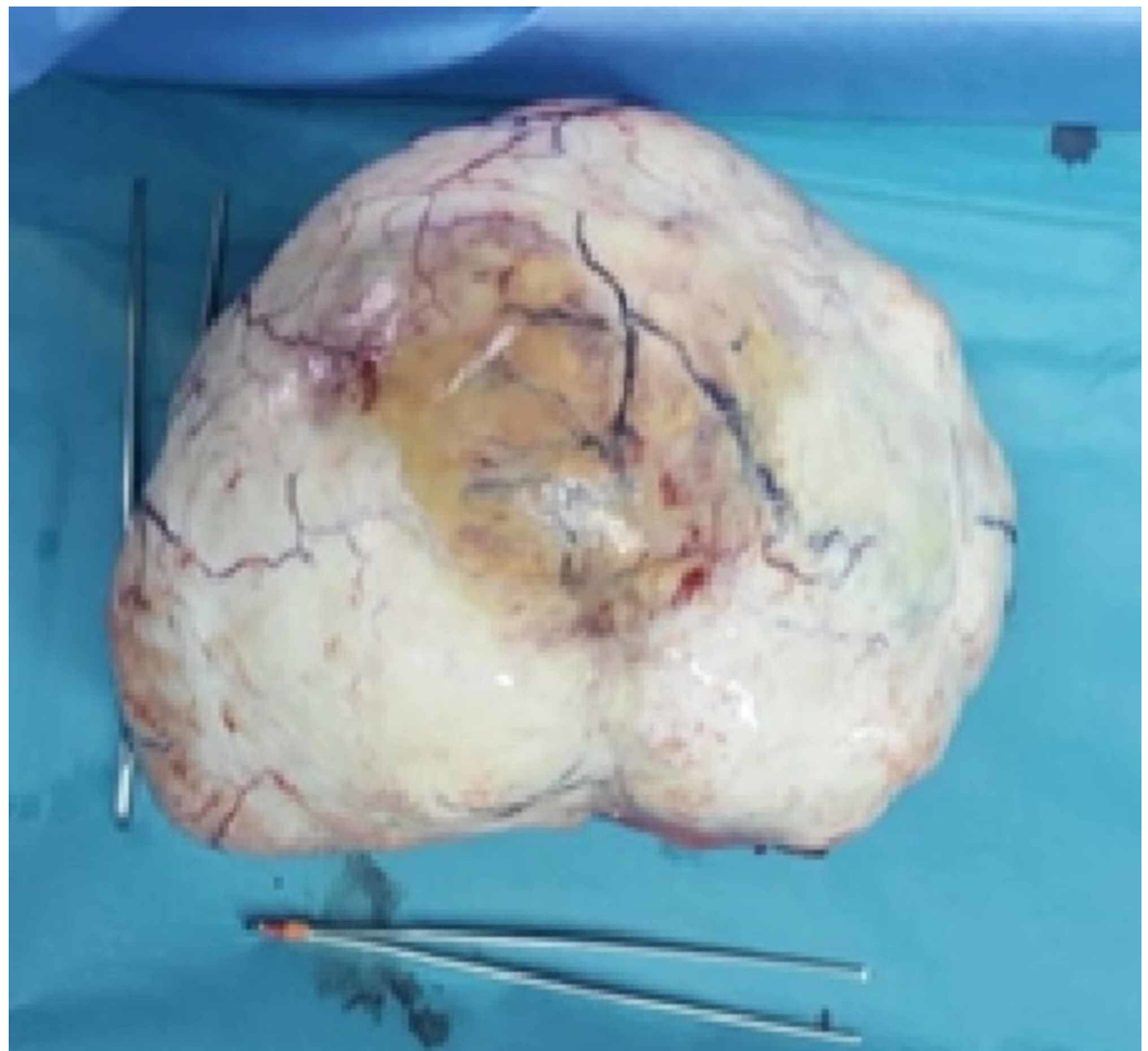
FIGURE 3: Right adnexal mass corresponding to an ovarian fibroma.

She was discharged two days after the surgery. On a follow-up visit three months later she reported no complaints, her lungs were clear on auscultation and the room air SpO 2 was 98% with normal vital signs. She had stopped smoking. The patient refused to undergo a repeat chest X-ray.