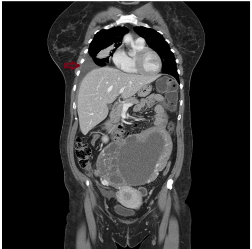
FIGURE 5: CT scan, coronal view. A heterogeneous pelvic mass of 17 cm diameter without lymphadenopathies was noted. The arrow points to the pleural effusion. A scanty amount of free peritoneal fluid was observed (not visible in this cut).

The patient underwent a hysterectomy and bilateral oophorectomy. A solid-cystic irregularly surfaced and highly vascular mass that depended on the right adnexa was found. The appendix adhered to the mass. Peritoneal free fluid was present. Intraoperative biopsy of the lesion was informed as a granulosa cell tumor, stage IA, later confirmed after complete excision of the mass. Three months later, the patient reported no symptoms, had normal lung sounds, and a normal chest X-ray (Figure 6). She has been followed up for 10 years by the Gynecologic Oncology Department and has remained free of disease.