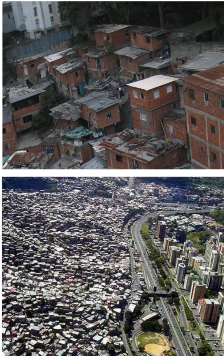
Figure 1 The first photo, taken from the nearby private medical facility, Centro Médico de Caracas, portrays living conditions of the studied community. The second, an aerial photo, (below) provides a better insight into these aspects of Caracas.

Visits were scheduled every 3 months and patients received a monthly phone call. During those calls they were reminded to take the prescribed medication and to follow recommendations on environmental control. Likewise, emphasis was placed on the date of the next hearing and on returning the blister aluminum packs for proper evaluation of adherence. Furthermore, and most importantly, they were urged to take note of exacerbations that merited medical care (extra domiciliary) from the local health care system.