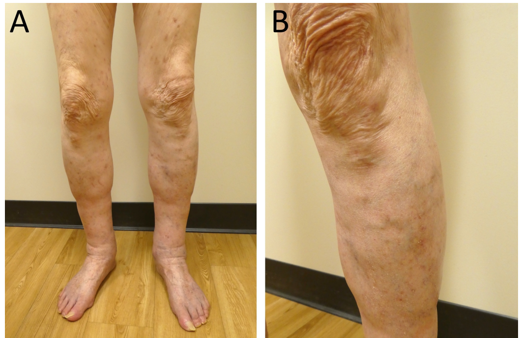
FIGURE 3: Resolution of bullous cutaneous leukocytoclastic vasculitis on the lower extremities.

Distant (A) and closer (B) views of resolved influenza vaccine-associated bullous cutaneous leukocytoclastic vasculitis following 12 days of oral prednisone and topical triamcinolone cream on the lower extremities of an 88-year-old Caucasian man.