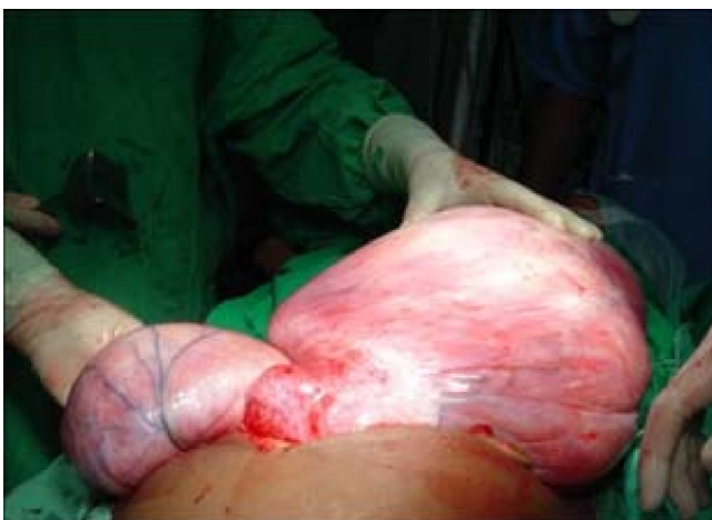
Figure 2 Intraoperative photograph of the tumor.

rated by edematous fibrous and myxomatous tissue. The fibrous tissue is in form of interlacing or parallel bands of collagen with edema. The myxomatous tissue comprise of stellate cells with fibrillary in mucinous setting (Figure 3). Immuno-histochemistry was positive for vimentin and desmin while negative for actin and myosin. These findings were consistent with the diagnosis of aggressive angiomyxoma.