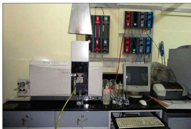
Figure 3: Atomic absorption spectrophotometer