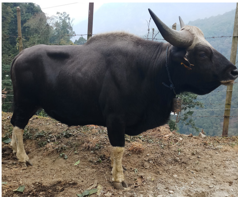
Figure 2. Mithun, ( Bos frontalis ), the neglected cattle species.

Mithun populations in India are categorized into four strains, namely Arunachal, Manipur, Mizoram, and Nagaland, according to the distinct physical and genetic features [24,25]. Phenotypically, Mithun has well developed and symmetrical body with distinct muscle [26], and dark reddish-brown to blackish-brown hair with white stockings (Figure 2). Adult males are larger, heavier, and have more developed body muscles and horns than females. Both sexes have horns pointed outwards and slightly curved upward with a tapering end, and the horn length ranges from 0.6 to 1.15 meters [12,27].