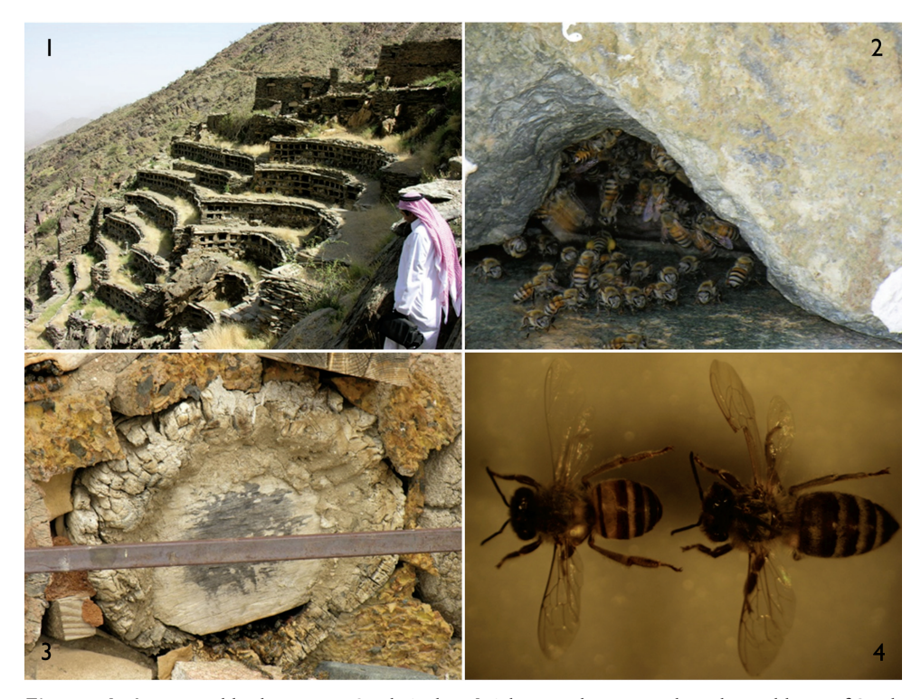
Figures 1–4. Bees and beekeeping in Saudi Arabia. I A historical apiary with traditional hives of Saudi Apis mellifera jemenitica Ruttner maintained over 500 years by the same family in Taif (there are many such apiaries in the area, with beekeepers maintaining these as a family tradition over numerous generations; honey from such apiaries is much costlier than those managed in Langstroth hives) 2 Entrance to a hive of A. m. jemenitica in Taif 3 A traditional log hive of A. m. jemenitica in Taif 4 Photograph showing size and other morphological differences between A. m. jemenitica and A. m. carnica Pollmann.

more rapid and effective development of novel strains, e.g., genetic lines developed bees high brood production, greater honey yields, selectivity for sugar solutions, resistance to viral diseases, etc. (e.g., Cale and Gowen 1956; Nye and Mackensen 1968; Kulinčević and Rothenbuhler 1975). Naturally, these and many other advances are employed widely in Saudi Arabia, although many traditional and often ancient beekeeping practices are simultaneously in widespread use (e.g., Figs 1–3).