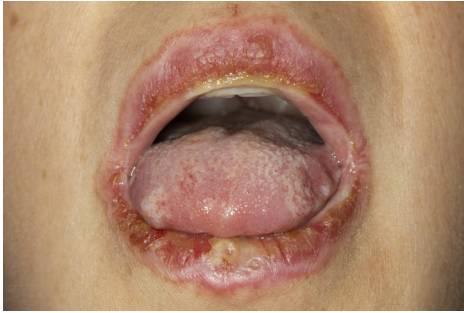
Fig 2. Erosions and ulcers on the oral mucosa.