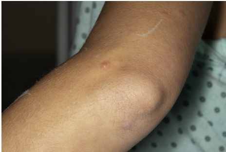
Fig 3. Scattered erythematous papules and vesicles on the limbs.