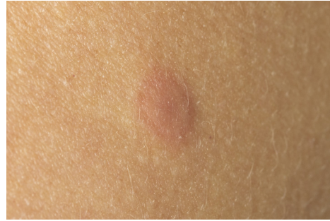
Fig 4. One atypical target lesion on the left arm.

Chest X-ray revealed a pulmonary infiltrate in the lower portion of the right lung lobe. Skin biopsy revealed interface dermatitis with numerous basal necrotic keratinocytes.