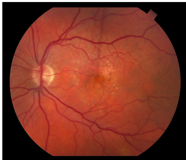
Figure 2 Color fundus photograph of the left eye is showing the presence of drusen with RPE changes and focal areas of geographic atrophy in the macula consistent with macular degeneration. Cup to disk ratio is 0.3 in the left eye with normal disk and vessels.

The management of NVG includes lowering IOP (often surgically) and PRP, which reduces the production of vasoproliferative factors by ischaemic retina and can induce regression of anterior segment neovascularisation.