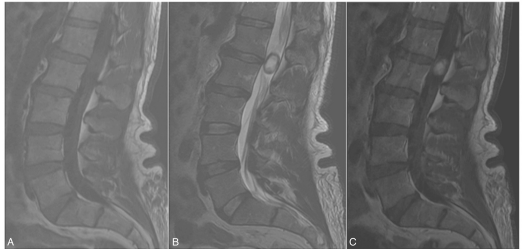
FIGURE 1: Magnetic Resonance Imaging (MRI) of the Lumbar Spine

Neuroimaging with an MRI of the lumbar spine with and without contrast demonstrated an intradural mass at the level of the conus measuring 1.4 x 1.1 x 2.2 cm with heterogeneous contrast enhancement (Figure 1). Small disc herniations were also noted at L2-3 and L4-5.