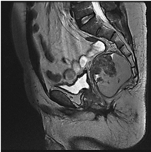
Fig. 1. Magnetic resonance imaging showing a 7.8-cm cystic lesion of the presacral area.