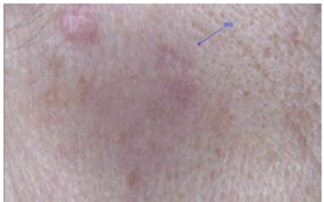
FIGURE 2: Aspect, three months after the biopsy, of the right preauricular region treated with BTXA, with a small skin-colored linear scar