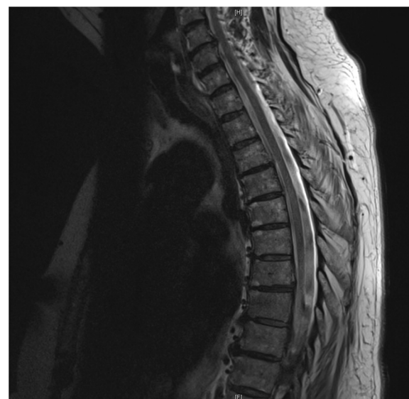
Figure 1 Sagittal magnetic resonance imaging of the thoracic spine on day 1 after the abdominal surgery and epidural anesthesia. Note the absence of canal compromise, edema, and bleeding.