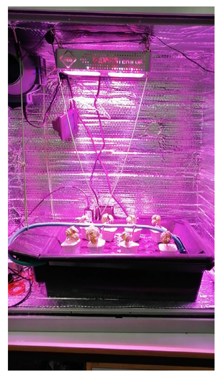
Fig. 2 Indoor farming small scale unit with additional reflectors.

calculations of Kublic et al. (2015) it was estimated that the average irrigation duration for lettuce is four and a half hours of total pumping daily.