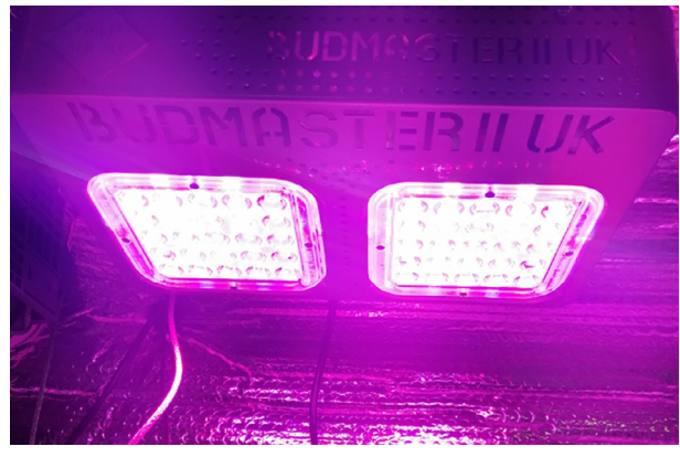
Fig. 3 Upward lighting, and use of reflectors in a small-scale experimental unit.

Based on the calculations and experiments conducted by Yokoi et al., 2003, it is shown that indoor vertical farms have 1.9 to 2.5 times higher LUE<sub>P</sub> in comparison to the greenhouses. Only 1% of the light energy is actually converted into salable portion of plants. Nevertheless, there are different techniques which can be applied and can improve the conversion factor to 3% or a little higher. A simple technique that can be followed is the application of interplant lighting, upward lighting, and use of reflectors (Fig. 3). Traditional lighting that is located only on top of the crop can cause undesirable shading in dense crops by uneven light distribution and lead to senescence of the leaves that are in lower levels. On the contrary, the